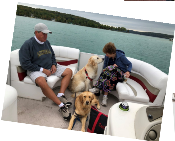
"I know you want to jump out and swim...not now!"