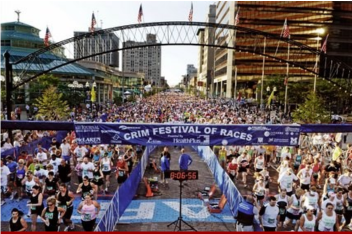
The Crim