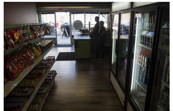
The Ground Floor