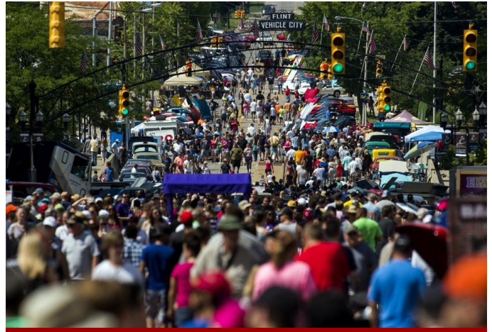
Back to the Bricks